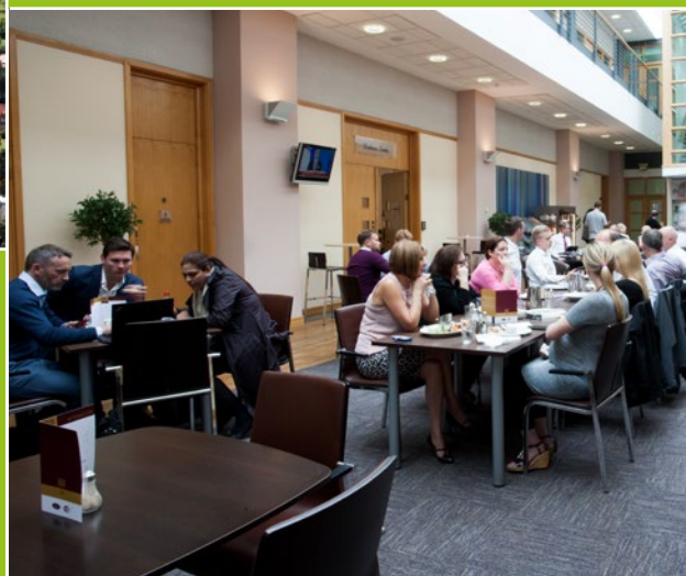
Wynyard Park House, Wynyard Business Park