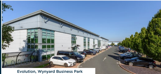
Evolution, Wynyard Business Park